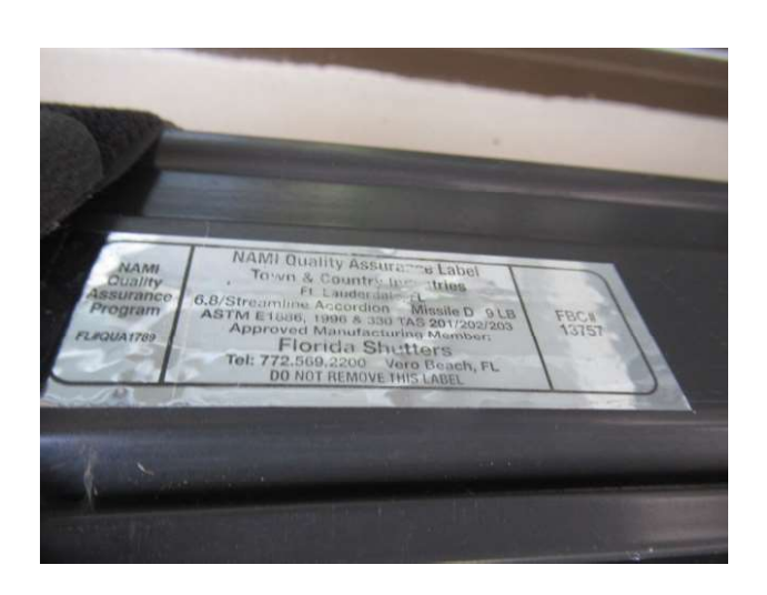
Impact rated accordion shutters