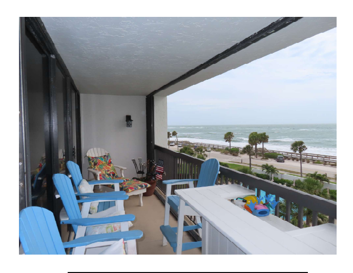
Impact rated accordion shutters