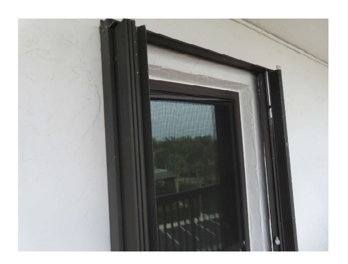
Impact rated accordion shutters