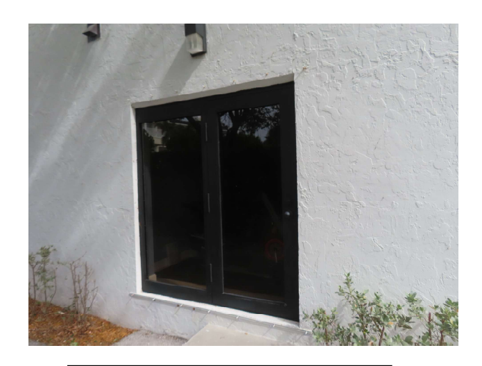
Large missile panels