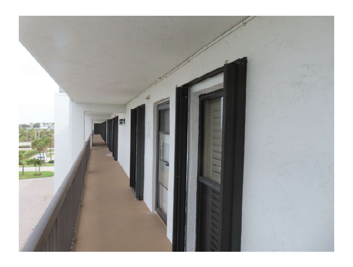
Impact rated accordion shutters