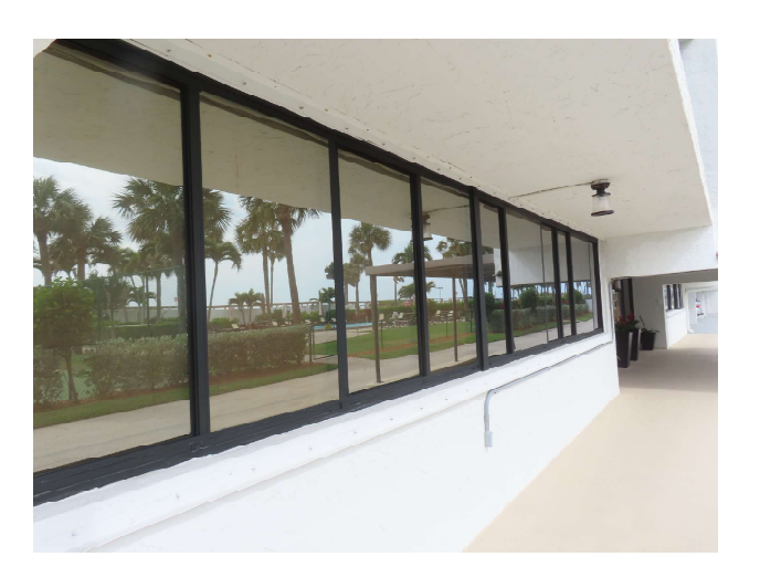
Large missile panels