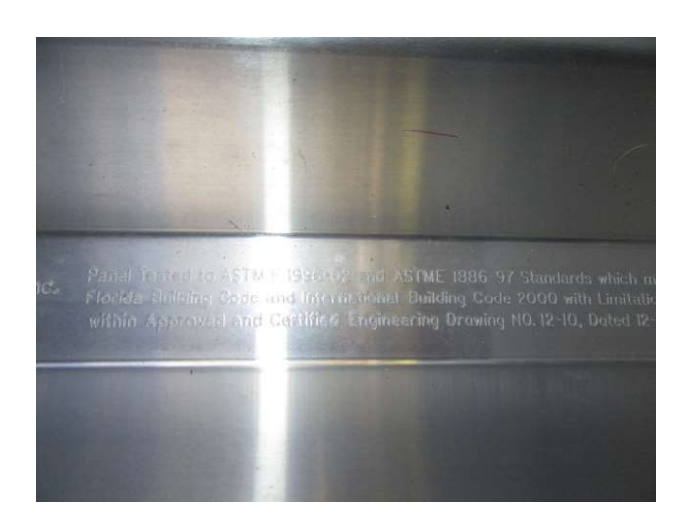
Large missile panels